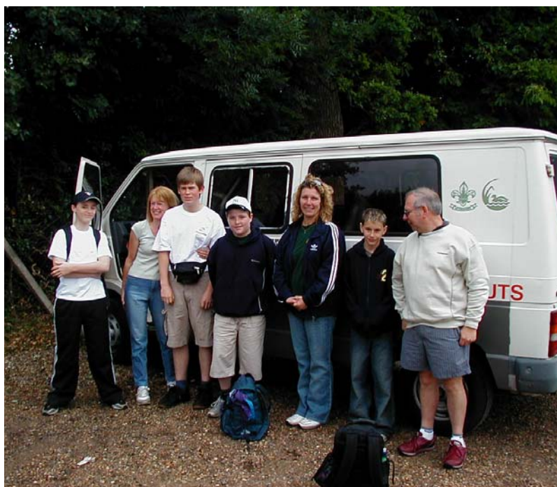
Some of the Group entries before the start of this years Tanners Marathon events in Leatherhead