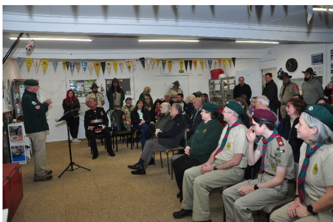
Members, families and friends