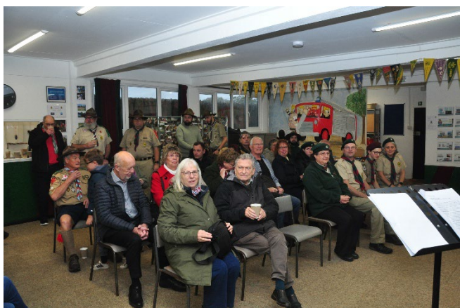
Members, families and friends