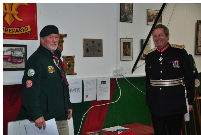
The plaque is unveiled