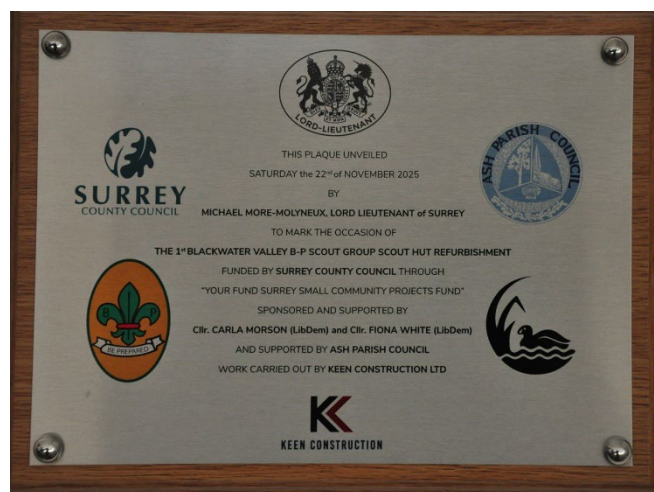
The commemorative plaque